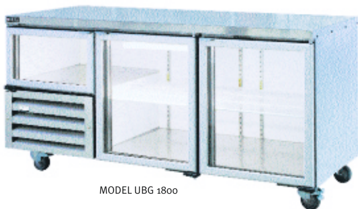
MODEL UBG 1800