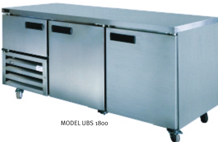
MODEL UBS 1800